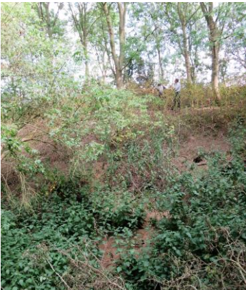
Below: The height of the inner bank can be seen in this image

However, it has not yet been possible to confidently identify the use of some structures and the 'rooms' inside so we are taking advice from subject-matter experts with the aim of better understanding how the White Monks really lived and worked at Warden Abbey. We hope to complete interpretation of the results in time for a 'grand reveal' in October (see events section).