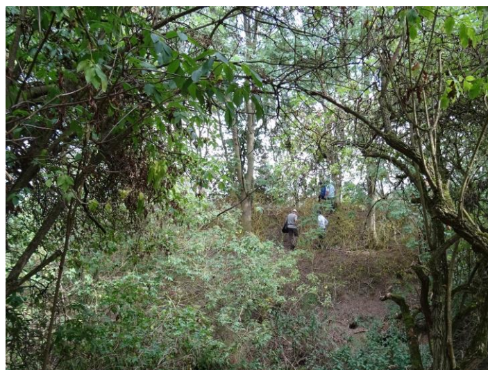
9 July 2017: Quince Hill – visitors examine the huge inner bank and ditch of the ring-motte.

Finally, work is now under way to create an OWHHS website, part of a commitment in our Warden Abbey Project grant funding bid to Greensand Country.