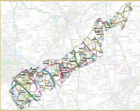
Greensand Country, stretching from Leighton Buzzard to Gamlingay