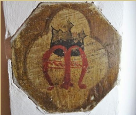
St Leonard's Church: The Sacred Monogram

OWHHS will be participating in the first Greensand Country Festival taking place from 26 May to 3 June 2018. A full guide to events is being published and is also now available on the following website.