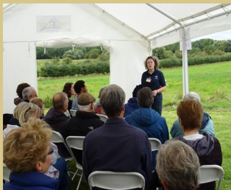
10 Sept 2017 Warden Abbey Vineyard Open Day – a talk in our history tent