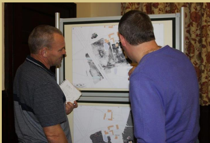
13 Oct 2017: Visitors examine our display of the Warden Abbey Geophysics results.

We may have been quiet in recent months but rest assured that we have been busy with research and planning events for 2018. The major focus is Warden Abbey and completion of our commitments to our sponsors in this project.